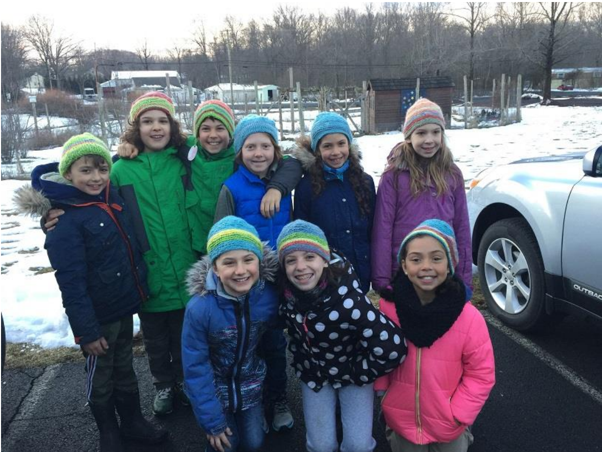
Third Grade as they left for a week at Hawthorne Valley Farm.

Artyard, 62A Trenton Avenue, Frenchtown, NJ 08825. Gallery Hours: Wednesday – Sunday, 11:00 AM - 5:00 PM.